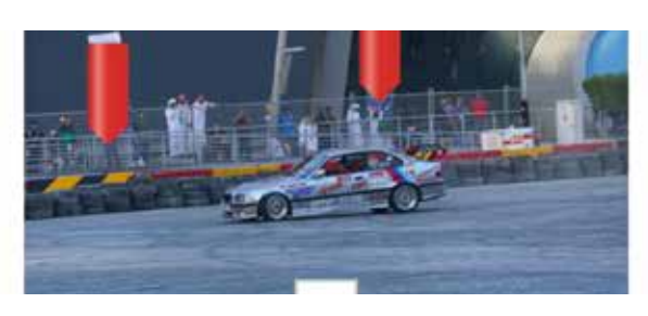
FLAG IN DRIFTING AREA