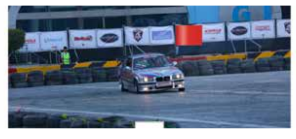
BANNER IN DRIFT AREA - (1.5m width & 1m height )